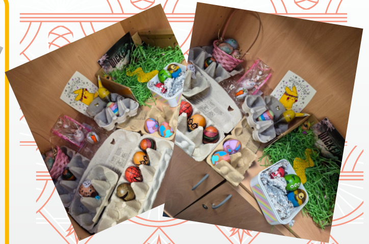
Some of the Easter Egg competition entries!