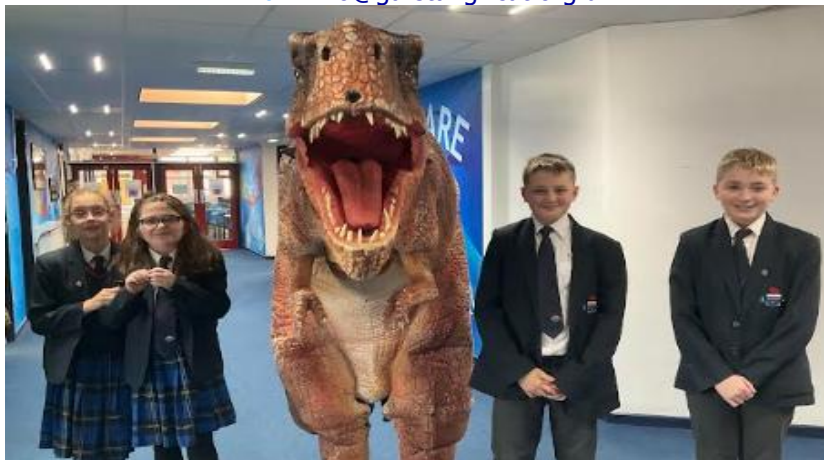
Year 8 students with REXY the Dinosaur

Bowgreave ☞ Garstang ☞ Lancashire ☞ PR3 1YE ☞ Tel: 01995 603226 ☞ Email: info@garstang.fcat.org.uk