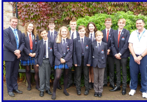
Student Council 2018-19

The school operates a Student Council with elected representatives from each year group. The council meets frequently and discusses issues raised by the student body.