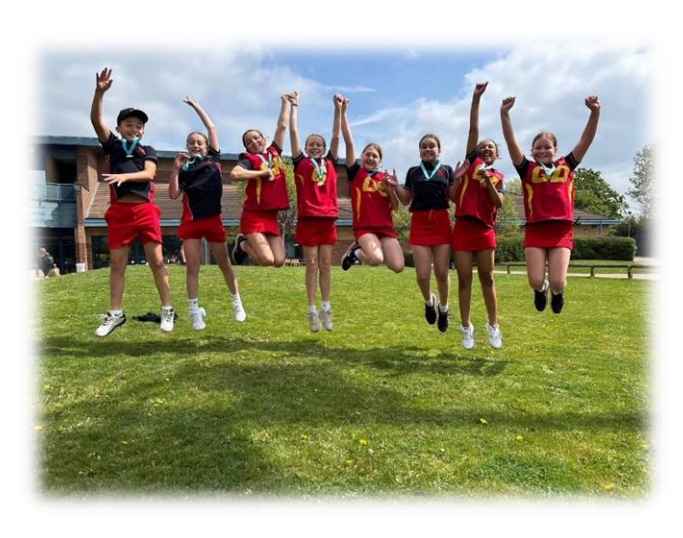
Year 6 Netball County Finalists – 2<sup>nd</sup> Place