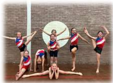
Year 5 and 6 Gymnastics