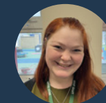
Miss Nightingale Early Years Practitioners