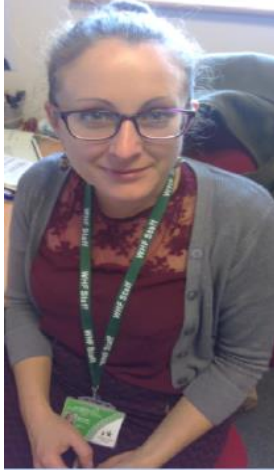
Designated Safeguarding Lead

If you have a concern about the safety or well-being of a child please speak to one of our safeguarding team. In this school this is: