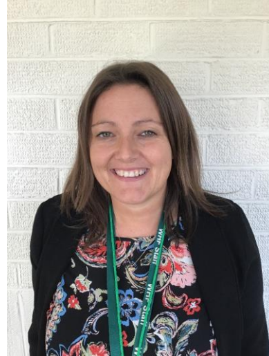
Deputy Designated Safeguarding Lead