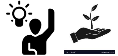
Active and Enriched