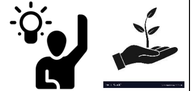
Active and Enriched