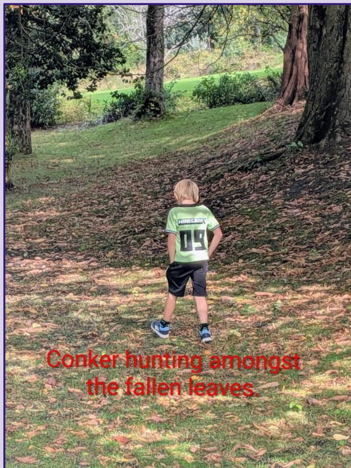
Conker hunting amongst the fallen leaves.