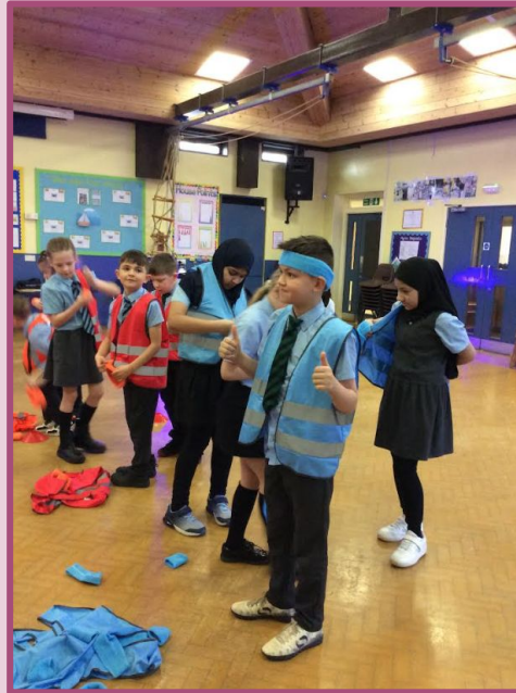
Before February half-term, Year 4 enjoyed a Glow Dodgeball session with Sports Cool during Ace time.