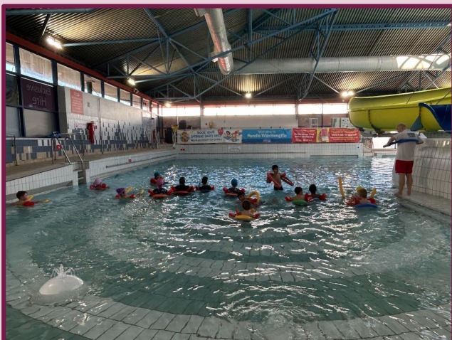
Year 4 started their swimming lessons last week. The children loved their time in the water.