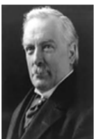
David Lloyd George