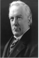
David Lloyd George