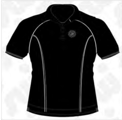
Polo shirt boys' or girls' cut (optional for boys)