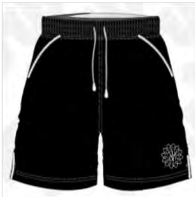
Black shorts with school logo