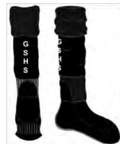
Black sports socks (embroidery optional)