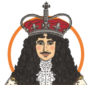
King Charles II