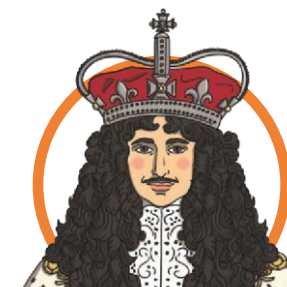
King Charles II