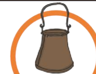
leather water bucket