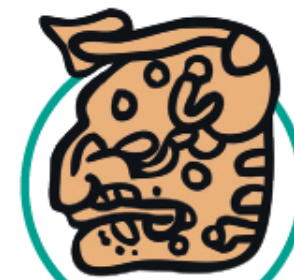
The Maya logogram for b'alam – jaguar

The Maya writing system, used to write several different Maya languages, was made up of over 800 symbols called glyphs. Some glyphs were logograms, representing a whole word, and some were syllabograms, representing units of sound. They were carved onto stone buildings and monuments and painted onto pottery. Maya scribes also wrote books, called codices , made from the bark of fig trees. Only priests and noblemen would know the whole written language.