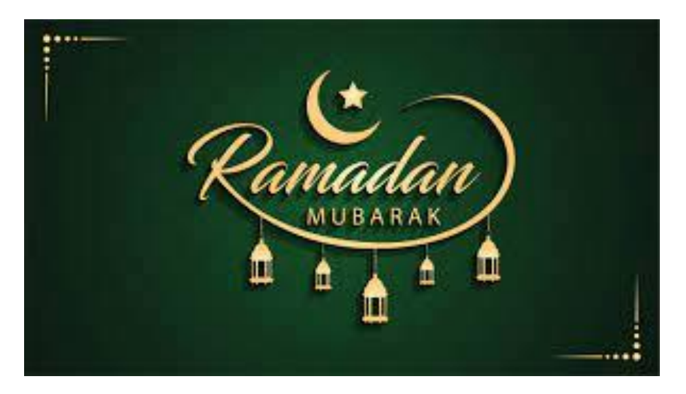
Wishing you a peaceful and happy Ramadan.