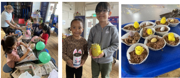
Art and craft

Have a look what we have been up too !!!