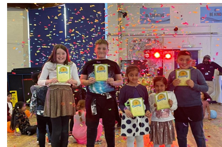
Our end of club disco