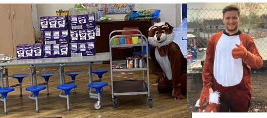
Easter Who done it challenge