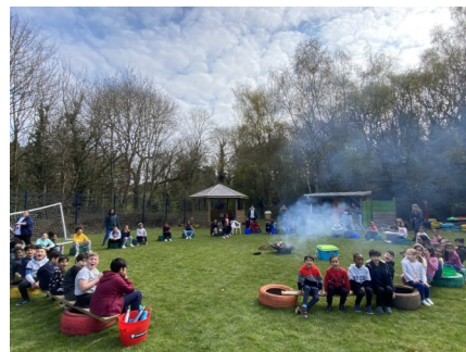
Camping experience day