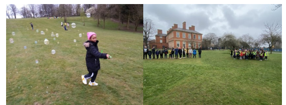
Red House park