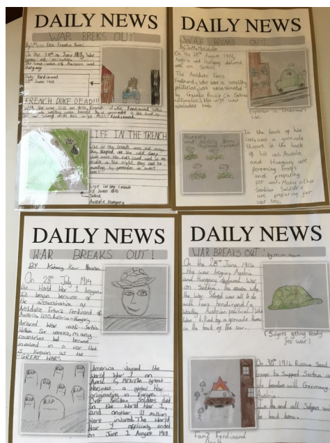
Year 5 Newspaper reports