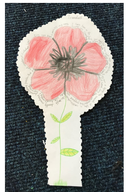
Year 6 Poetry