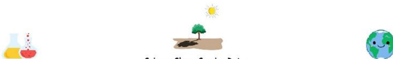
Science Share Session Dates

The share sessions are an hour long and include a 15-minute presentation about science before heading down to classes to join in with the investigations. See below for the dates and timings of the share sessions – we hope that you can make it!