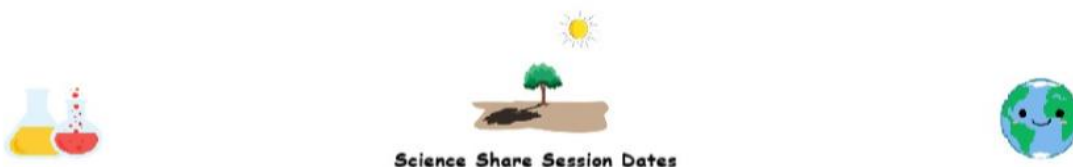
Science Share Session Dates

The share sessions are an hour long and include a 15-minute presentation about science before heading down to classes to join in with the investigations. See below for the dates and timings of the share sessions – we hope that you can make it!