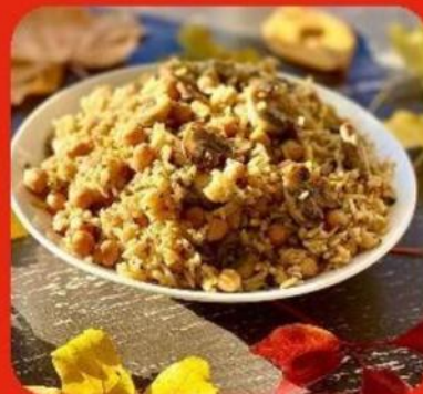
MIDDLE EASTERN PILAF