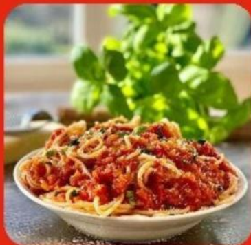
ITALIAN PASTA SAUCE