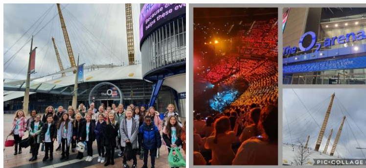
Young Voices at the O2

Gusford has been identified by the Government as a school for the Ipswich Priority Education Investment Programme. Attendance has been noted as inadequate at the school and despite the school following the recommended procedures, there is not enough of an improvement. As a result, we will be receiving official support externally to address poor attendance to ensure children are accessing the education they are entitled to. Please see the attached sheet to help you identify if your child is considered having good attendance. If you have any questions please do get in touch.