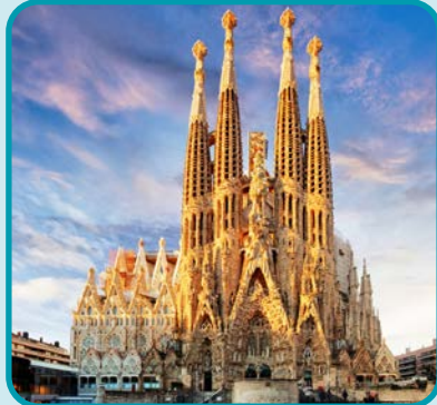
La Sagrada Familia, Barcelona (Antoni Gaudi)