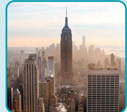
Empire State building, New York City (Shreve, Lamb & Harmon)