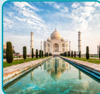
Taj Mahal, India (Ustad Ahmad Lahori)