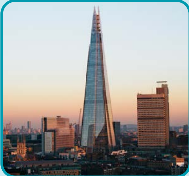
The Shard, London (Renzo Piano)