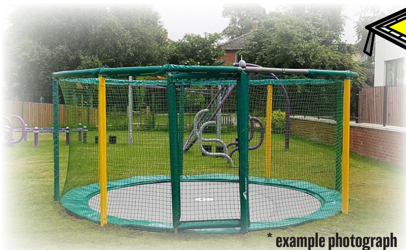
* example photograph

We're having a new trampoline installed in June to replace the one that we have at the moment which is broken. We have some very bouncy students at Hamilton who love to bounce so we need a commercial grade trampoline for them. The money has come from Assura Medical, Direct Line and the Handsworth Lions Club.