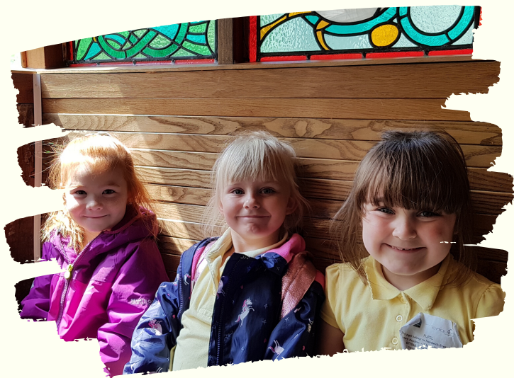
Riding the Saltburn Tram Lift!

We love to take the children on school trips and encourage parents to join us wherever possible. Due to school funding, we often ask parents for a small, voluntary contribution to aid the cost of trips. Where we are not able to raise enough money for a trip we would unfortunately have to cancel it.