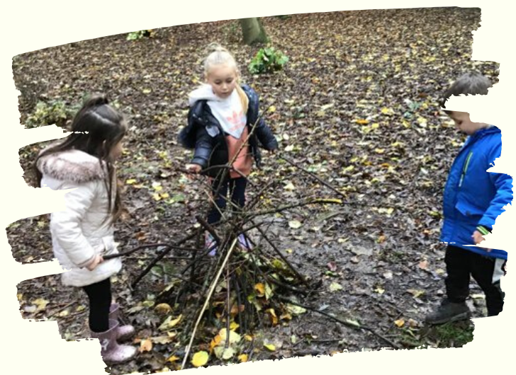
Outdoor Classroom Day at Wynyard Woodland Park!