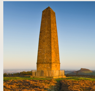
Captain Cook's Monument