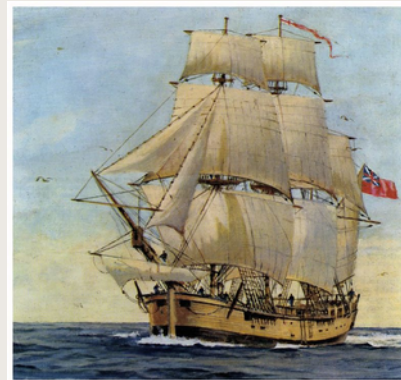
Captain Cook's Ship, HMS Endeavour