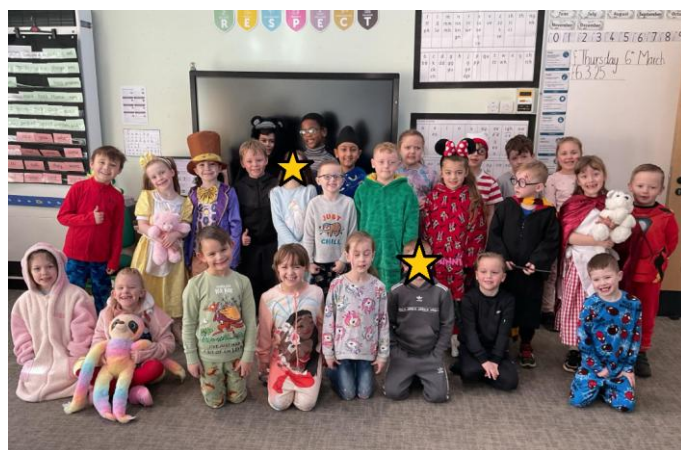
Year 2 enjoying World Book Day

Children have also received their special World Book Day Book Token, which they can exchange for a £1 World Book Day Book from selected retailers, or put it towards a more expensive book of their choosing.