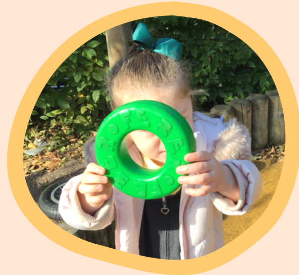
Maths Number and numerical patterns