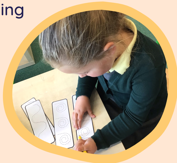
Literacy Comprehension, word reading and writing