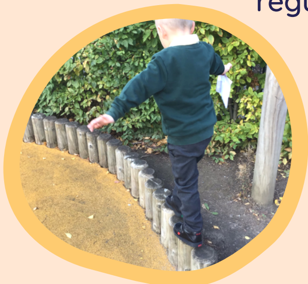
Physical Development Gross motor skills and fine motor skills