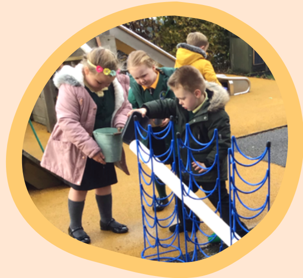
Personal, Social and Emotional Development Managing self, self-regulation and building relationships.