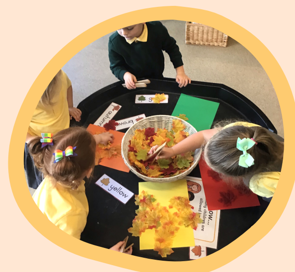
Understanding the World Past and present, people, cultures and communities, and the natural world