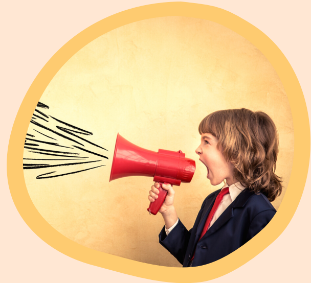
Communication & Language Listening, attention and understanding, and speaking.

There are 7 key areas of learning for young children which will be developed in Reception. You can also help develop these areas at home!