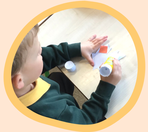
Expressive Arts & Design Creating with materials and being imaginative and expressive