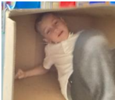
Hiding in a dark space!