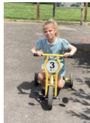
In the sunshine making shadows!