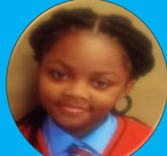
Meet the House Captains

Isaiah 9:6 : For unto us a child is born, unto us a son is given: and the government shall be upon his shoulder: and his name shall be called Wonderful, Counsellor, The mighty God, The everlasting Father, The Prince of Peace.