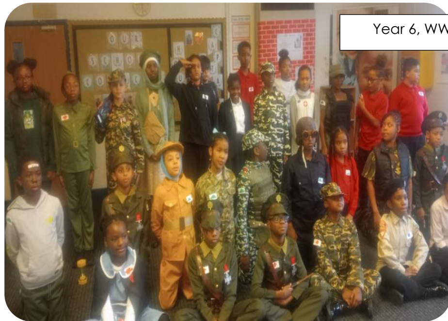
Year 6, WW1 Day