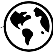
The Solar System Structure