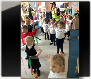
Ribbons in FS

Secondary School applications deadline 31st October 2024