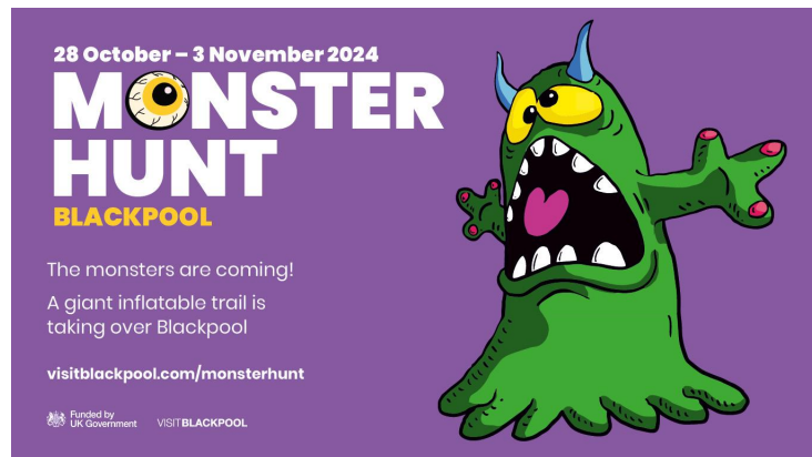
The Monster Hunt is fully funded and supported by the UK Government through its Shared Prosperity Fund.

For more information, head to: http://www.visitblackpool.com/monsterhunt