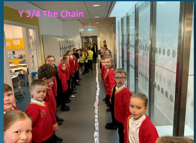
Y 3/4 The Chain