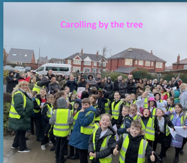
Carolling by the tree