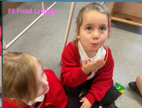
FS Food tasting