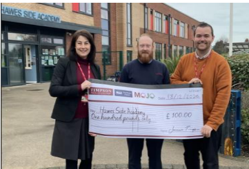
Pictures: Year 3 singing carols, a little elf & a BIG cheque from Timpson's