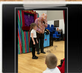
Punch and Judy show!