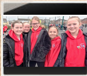
Year 6 girls get together - relationships

A big thank you to the year 6 helpers on Parents' Evening. They did an amazing job and represented the academy well in line with our values.