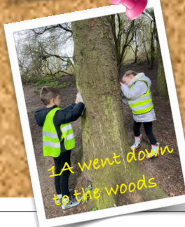
1A went down to the woods