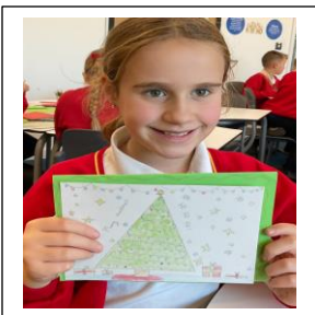
Pictures Mellor's Chrismassy biscuits, Year 4 maths, Year 4 in action and Lei's Christmas creation