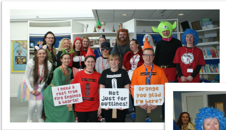
World Book Day!