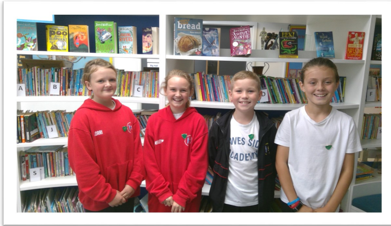
Our wonderful Head and Deputy Boys and Girls - a great start to the year!

Blackpool Dungeons visited our Y5 children and gave them a delightful insight into living with the plague!