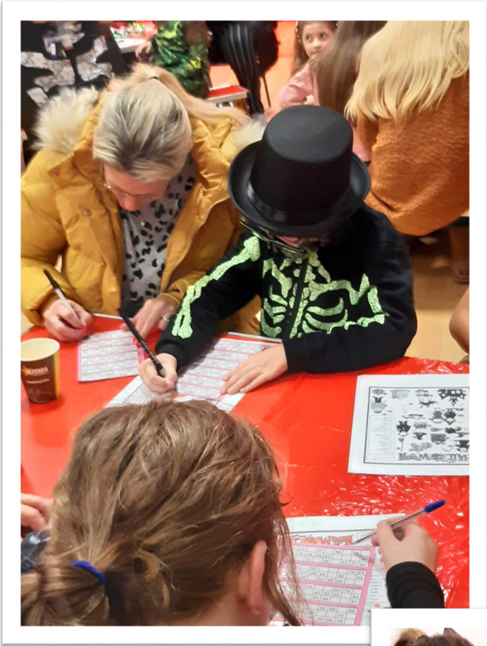
Ghostly fun at our PTFA Halloween Spooky Bingo