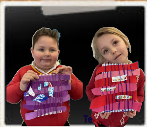
Being crafty in year 1

24th May break up for half term (normal time)