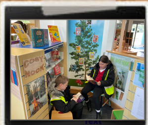
Enjoying a book at the library