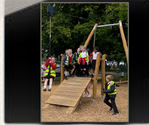
Zip wire fun!