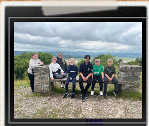
Picture perfect adventures