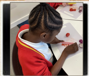
Making salsa dips in 4A