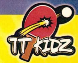
Table Tennis is perfect for children of all abilities

Children and parents will be warmly welcomed by the team. Every 1 hour session will consist of a warm-up... some off-the-table activities... on-the-table exercises... and fun games.