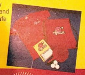
Table tennis is great for fitness, and provides valuable time away from video games and social media in a safe environment.

Starting from February 2020 / 8 Weeks Blackpool Sports Centre, West Park Drive, Blackpool, Lancashire, FY3 9HQ