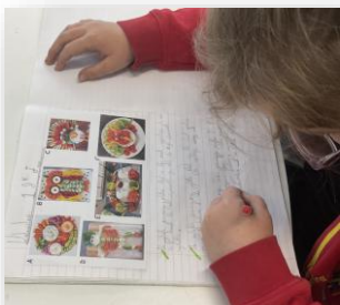
Hard at work in Year 2

‘She is always there to offer a helping hand. What a good friend’