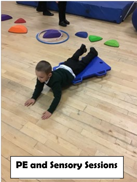
PE and Sensory Sessions