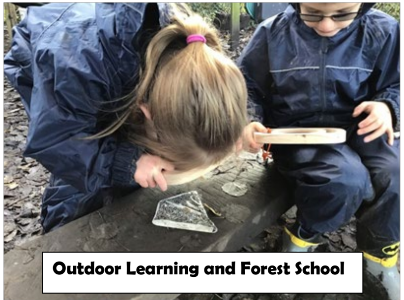
Outdoor Learning and Forest School