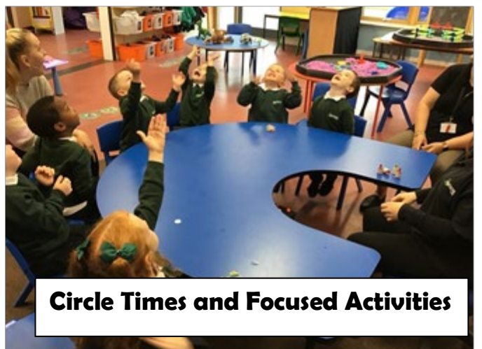
Circle Times and Focused Activities