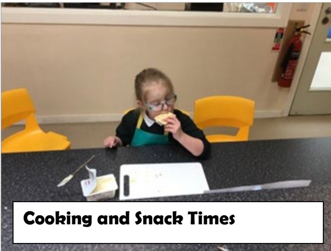
Cooking and Snack Times