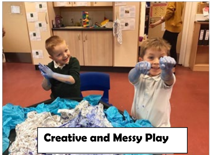
Creative and Messy Play