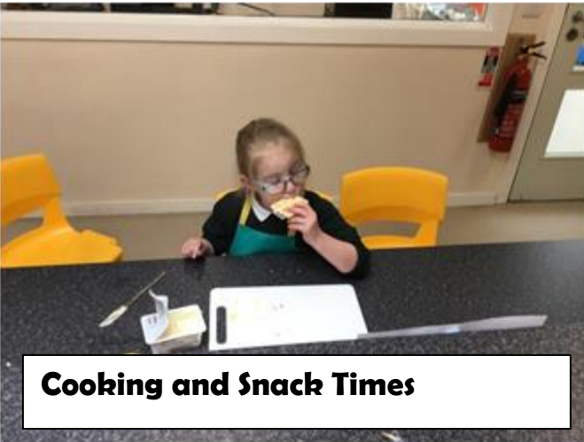
Cooking and Snack Times