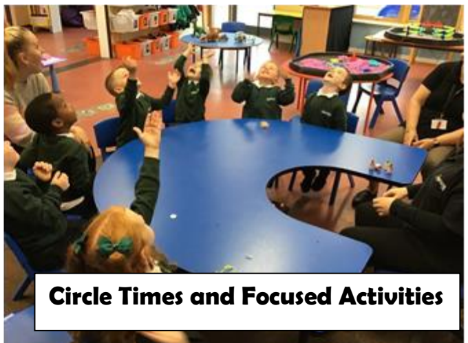
Circle Times and Focused Activities