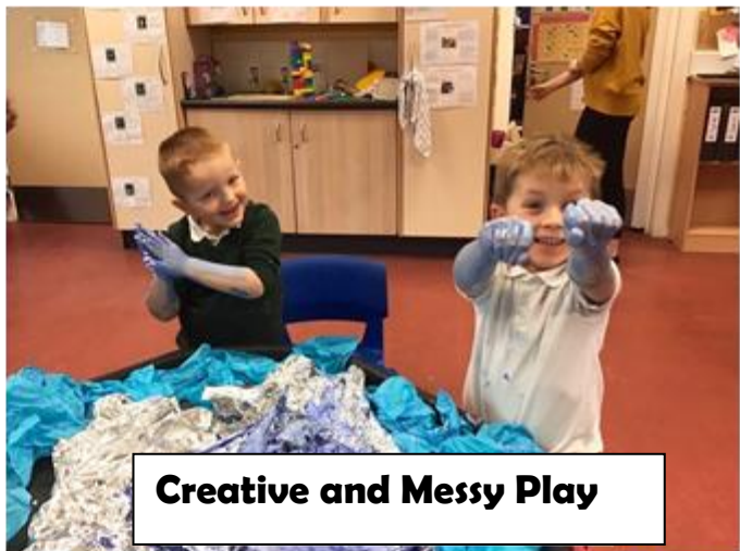
Creative and Messy Play