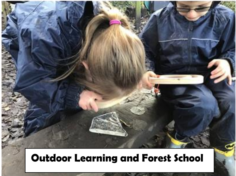
Outdoor Learning and Forest School