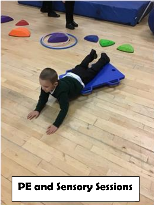
PE and Sensory Sessions