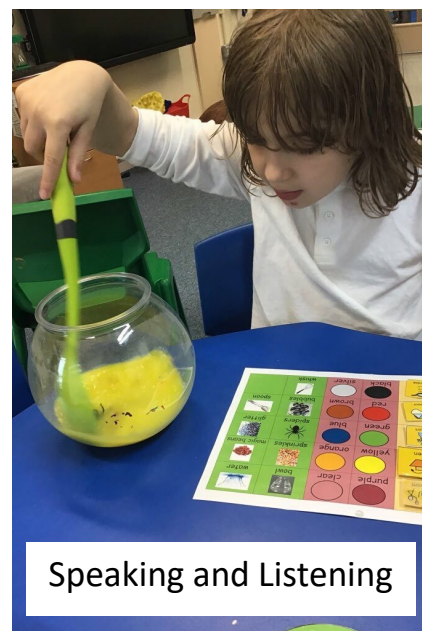
Speaking and Listening