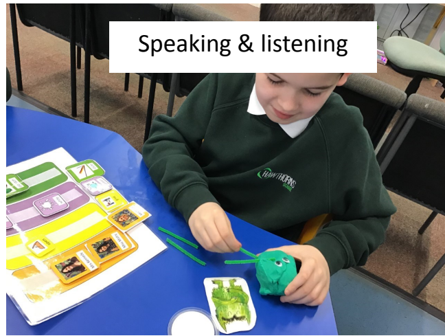
Speaking & listening